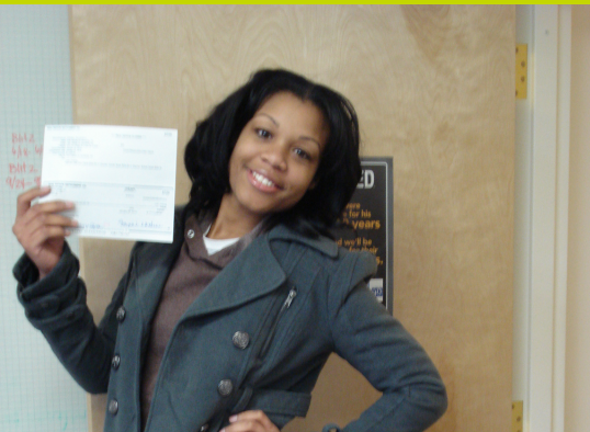
Financial Literacy education