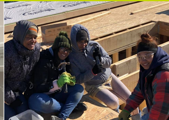
New friends & support system