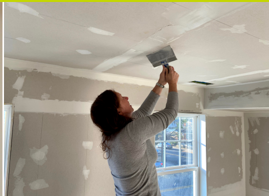
Basic home repair skills